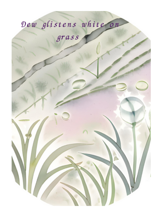
Dew glistens white on grass