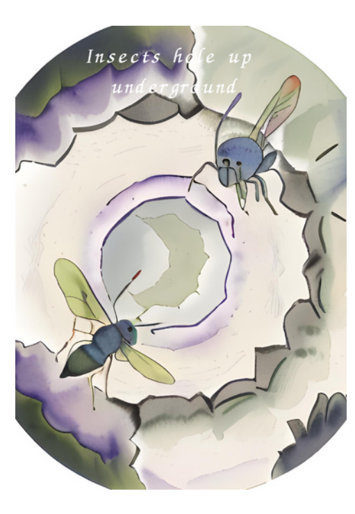
Insects hole up underground