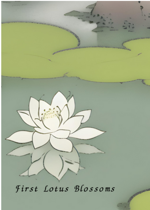
First lotus blossoms