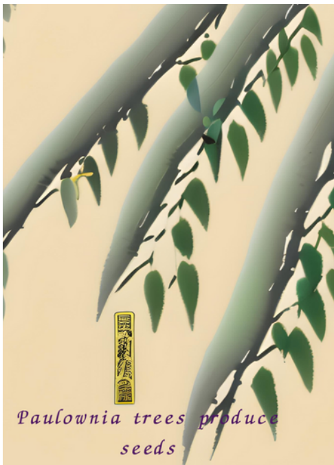
Paulownia trees produce seed